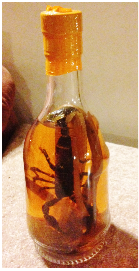
Be doubly potent (or doubly sick) if you drink this elixir containing a snake with a scorpion in its mouth, this week's second prize.

Buy him a copy of the book "Legal Ethics [Are] for Dummies"